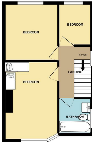
1ST FLOOR 357 sq.ft. (33.2 sq.m.) approx.